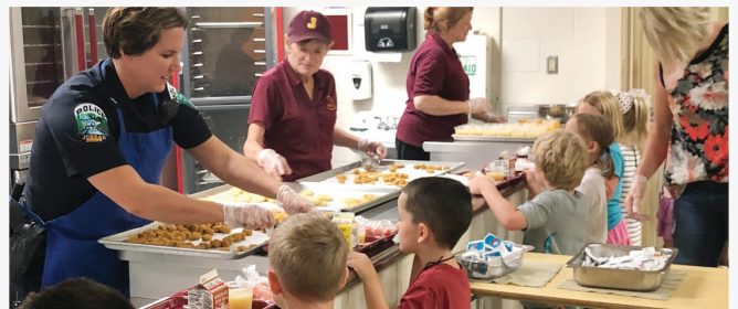
Proximity of students and hot wells in serving counter too close when receiving meals.