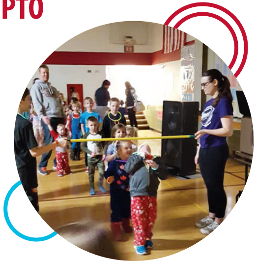
Winter 2019 ELS-PTO Pajama Party! So much fun!